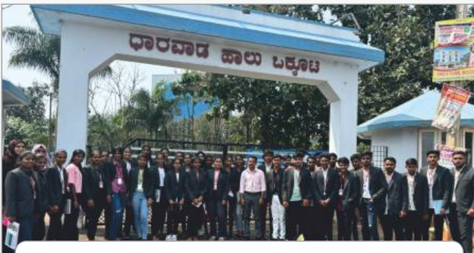
Industrial visit to KMF Dharwad