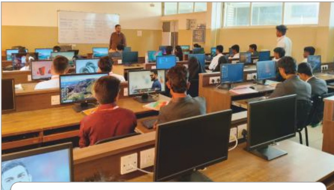
Certification Course on Digital Marketing

Business Analytics Artificial Intelligence