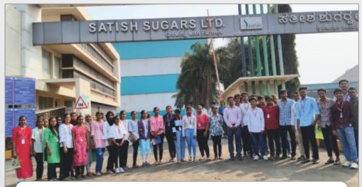
Industrial visit Satish Sugars Pvt. Ltd