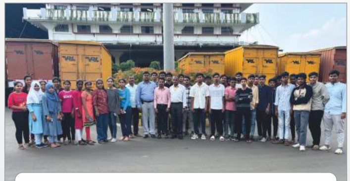
Industrial Visit to VRL Hubli