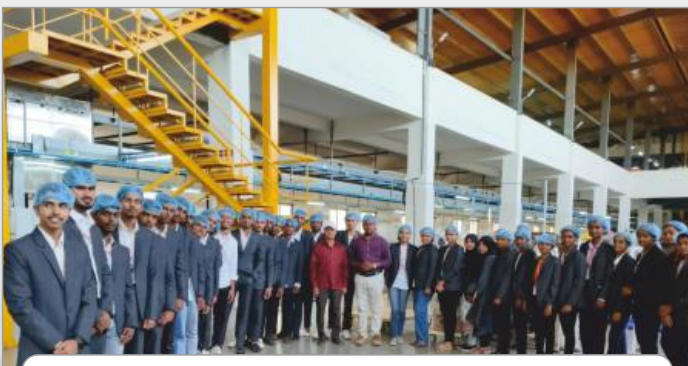
Industrial visit to Parle G