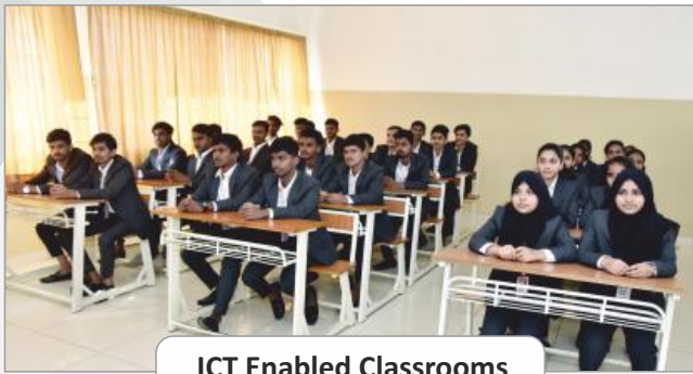
ICT Enabled Classrooms