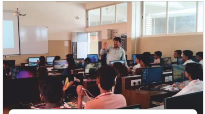
Certification Course on Excel and Advance Excel